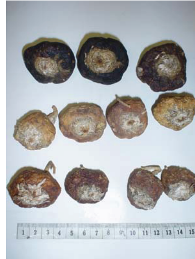
FIGURE 1: Dried hypocotyls of naturally dried black (upper), yellow (middle), and red (bottom) maca.

The principal and the edible part of the plant is a radish-like tuber that constitutes the hypocotyl and the root of the plant. This hypocotyl-root axis is 10–14 cm long and 3–5 cm wide and constitutes the storage organ storing a high content of water. After natural drying, the hypocotyls are dramatically reduced in size to about 2–8 cm in diameter (Figure 1). The average weight of the dried hypocotyls may